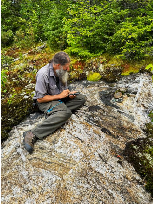
Figure 2: Geologist examining gneiss with pegmatite intrusions. Note sharp contact with pegmatite just to right of compass.