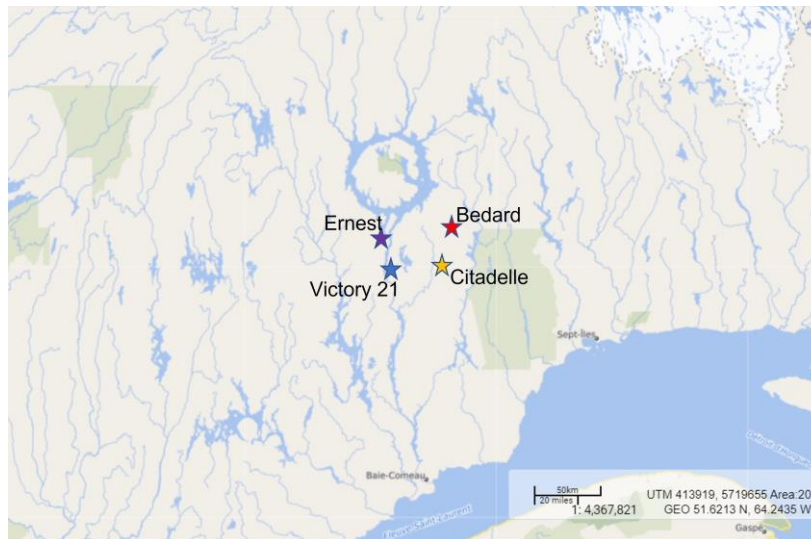
Figure 1: Manicouagan Project

Along with highly prospective metamorphic and igneous complexes our Manicouagan project has excellent infrastructure with hydro power facilities and access. Highway 389 splits the properties and secondary access provided by recent forestry activities.