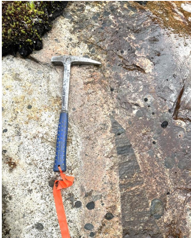
Figure 3: Felsic pegmatite intruding in gneiss.