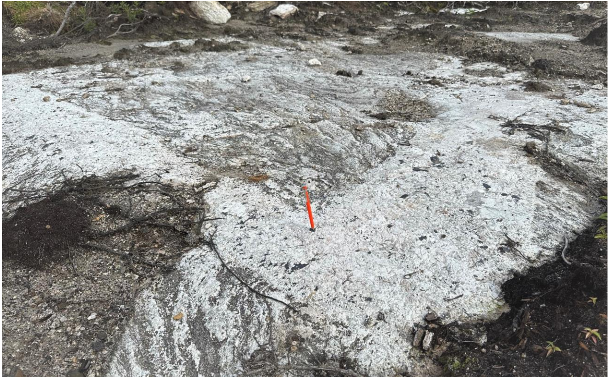
Figure 3: Magnetite rich pegmatite body containing a large piece of basement gneiss

Figure 3 is a photo of a several metre wide angular block of basement gneiss contained within a large pegmatite body on the Ernest property. This feature may be a rim zone result of the Manicouagan impact event. The crust (basement gneiss) was melted for several thousand metres at the centre of the impact but the rim zone would have been intensely fractured and broken. The volatile phase, a combination of the melted meteor and crust material, would have been injected into the fractured rim zone. This may be a picture of the resulting chaotic lithologies.